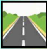
40 ft - CC Roads