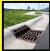
Storm Water Drains